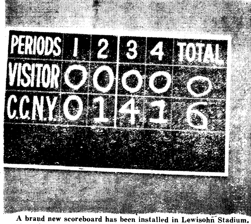
Although it will only give period by period scores, an electric scoreboard, similar tothe one in Wingate Gym, may replace it next year. The present scoreboard is chalked by hand.